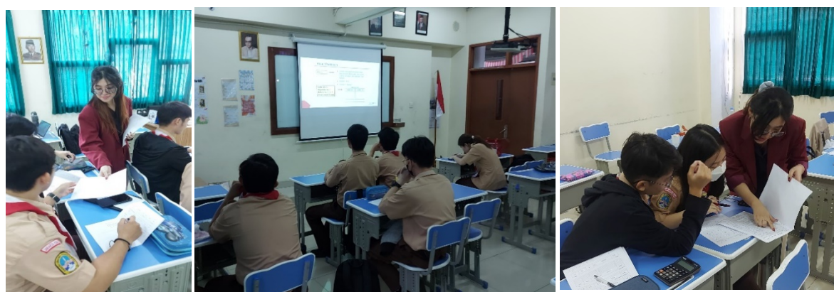
Fig. 3. Community service photo documentation

Students from SMA Tarsisius 1 Jakarta took part in this community service activity, which not only supplied them with theoretical information but also gave them an experience that was both entertaining and educational, which were both beneficial to their education. A learning environment that fostered active student participation in the process of developing a profound grasp of accounting principles and applying those concepts to real-world business scenarios was successfully created through the application of the cooperative learning approach, which was successful in generating such an environment. The photo documentation that is relevant to the implementation of the community service can be viewed in Figure 3.