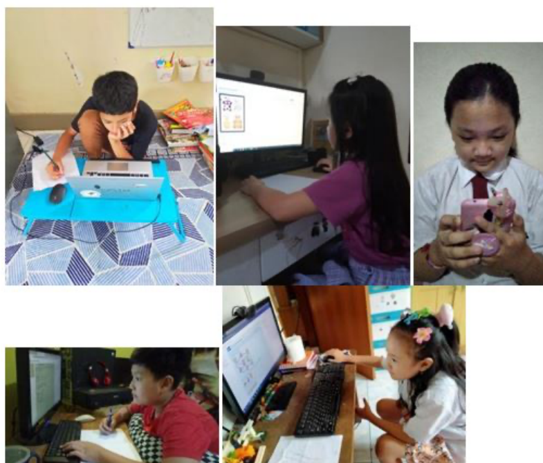
Fig. 4. Online Bebras Challenge for elementary school

In addition to limitation of telecommunication infrastructures in Indonesia or tools used by the participants, Bebras Indonesia opened exceptions reporting at the time of the contest. The exceptions may be power outages or internet disturbance. In exceptional cases, students or parents (for elementary school) could report to the teacher. The teacher delivered the report to the mentor. The mentor sent the report to the coordinator. The coordinator reported the cases to Bebras Indonesia. The communication was done through chats via WhatsApp group, calls, or emails. The participants, which encountered the exception were recorded. On 13 November 2020, after the challenge was finished, the contest committee evaluated the cases and decided the way out. The committee gave an opportunity to the participants of the cases to redo the contest in certain schedules.