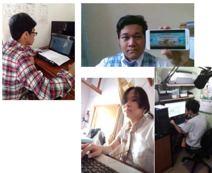
Fig. 5. Online Bebras Challenge for junior and senior high school.

Table 2 shows information about contest participants’ distribution in the Maranatha Bebras Bureau. Total participants were 1,740, with 190 students in junior elementary school (11%), 338 students in senior elementary school (19%), 918 students in junior high school (53%), and 294 students in senior high school (17%). The order from the most to the least number of participants were junior high school, elementary school, and senior high school. Based on gender, male participants were 52 % and female participants were 48 %. Elementary school participants were from 24 schools, where 13 schools have followed the Bebras Challenge from the previous year, and 11 new schools. Junior high school participants were from 18 schools, with 3 new schools, while senior high schools from 19 schools with 6 new schools.