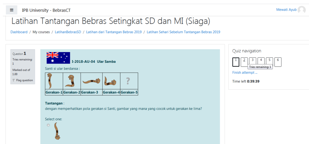
Fig. 1. Bebras task example accessed through site of IPB.

A Bebras task consists of a description and an interesting picture as a stimulus, that should be answered in three minutes. The answer can be a multiple choice, a short answer, or interactivity answer using drag and drop. In Indonesia, Bebras tasks are available in discussion books which can be downloaded from the official site of Bebras Indonesia (link https://bebras.or.id/v3/pembahasan-soal/ ). The tasks can also be accessed online at the link https://latihanbebras.ipb.ac.id/ , that is a site to practice Bebras tasks at IPB server. The Bebras task example is shown in Figure 1. The lecturers should be ready to discuss with the teachers, if there are tasks which need some explanations of the solutions.