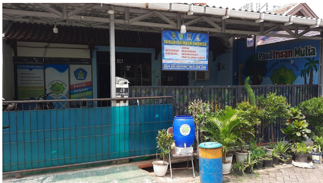
Fig. 1. School building of PAUD Insan Mulia Tangerang

Figure 1 shows the Insan Mulia PAUD School building located at H. Maskur Street No. 49 RT. 02, RW. 02, Pinang, city of Tangerang. Computer facility support is needed to facilitate teaching and learning activities at the school because currently there is no computer equipment to support activities. Thus, a CS (Community Service) program proposed installing computer equipment for Insan Mulia PAUD School so that the activities at the school could run normally and optimally.