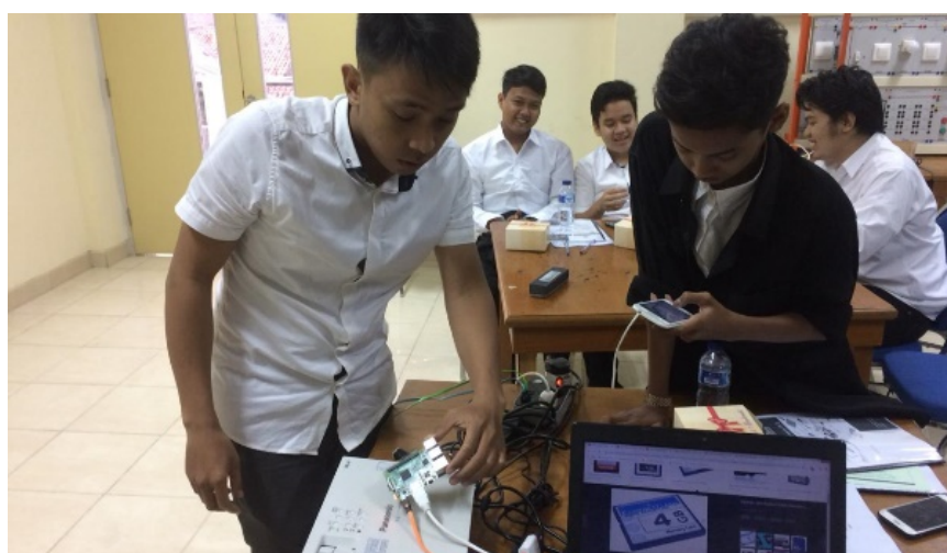
Fig. 3. Activity on class