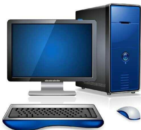
Fig. 2. Computer illustration

Figure 2 shows an illustration of a computer as an electronic device that connects one component with another to produce information. In prior conditions, Insan Mulia PAUD School had not been supported by adequate computer equipment so the school could not support various activities in the school optimally. A revitalization was needed to set up computer equipment at Insan Mulia PAUD School to support teaching and learning activities at the school.