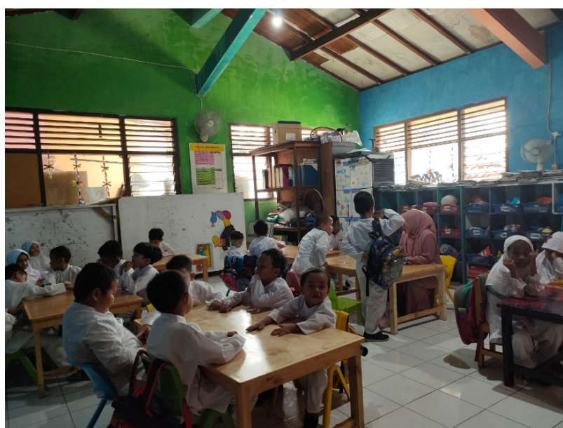
Fig. 1. Daily learning life at Raudhatul Athfal Taufiqurrahman

In an effort to support this behavior, various approaches are needed on an ongoing basis. As an appreciation for prosocial behavior, service activities were carried out again with partner audiences in Raudhatul Athfal (RA) Taufiqurrahman, Beji Timur Village, Depok. Raudhatul Athfal is a kindergarten-level educational institution under the auspices of the Ministry of Religion. The learning atmosphere can be seen in Figure 1.