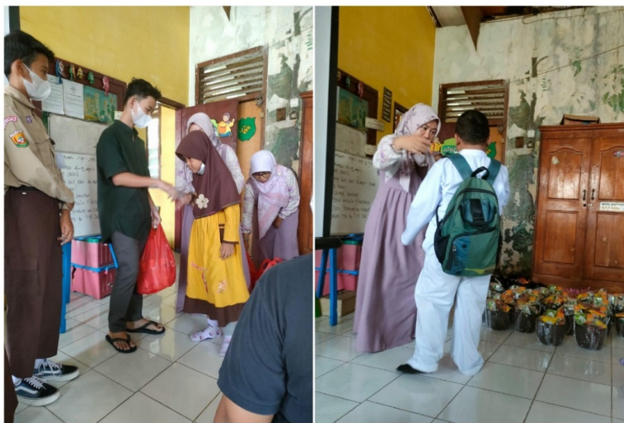
Fig. 3. Sharing with each other at RA Taufiqurrahman

As before, activities with children started with storytelling with the main message about sharing. This togetherness makes the children happy, become more familiar, and experience directly the beauty of sharing with others. With the support of teachers and parents, children would become more accustomed to social activities. Their support can touch their empathy so they become interested in social activities. Children's actions in sharing and then being rewarded by receiving gifts is an expression of love, making it an unforgettable experience for children. The depiction of the activity is shown in Figure 3.